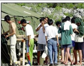
Many asylum-seekers had been held on the Pacific island of Nauru

He said that the United Nations Refugee Convention did not prevent asylum seekers from being returned to dangerous places.